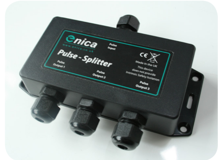
Standard Pulse Splitter