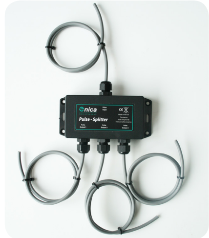
Waterproof Pulse Splitter