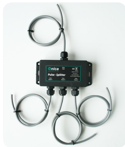
Waterproof Pulse Splitter